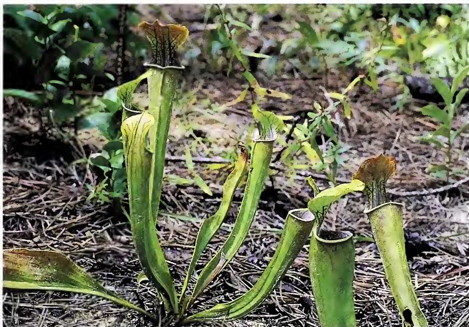
Figure 3. Small Sarracenia oreophila plants persisting despite frequent poaching at a flatwood bog.